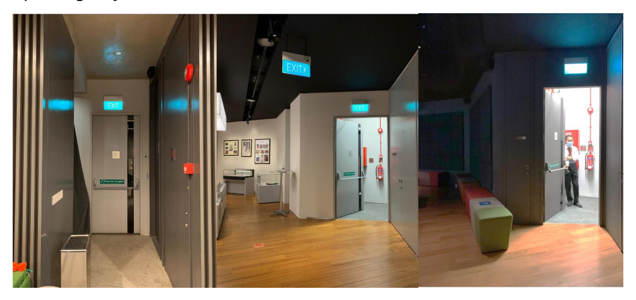
From left to right: emergency access stairs on levels 2 – 4