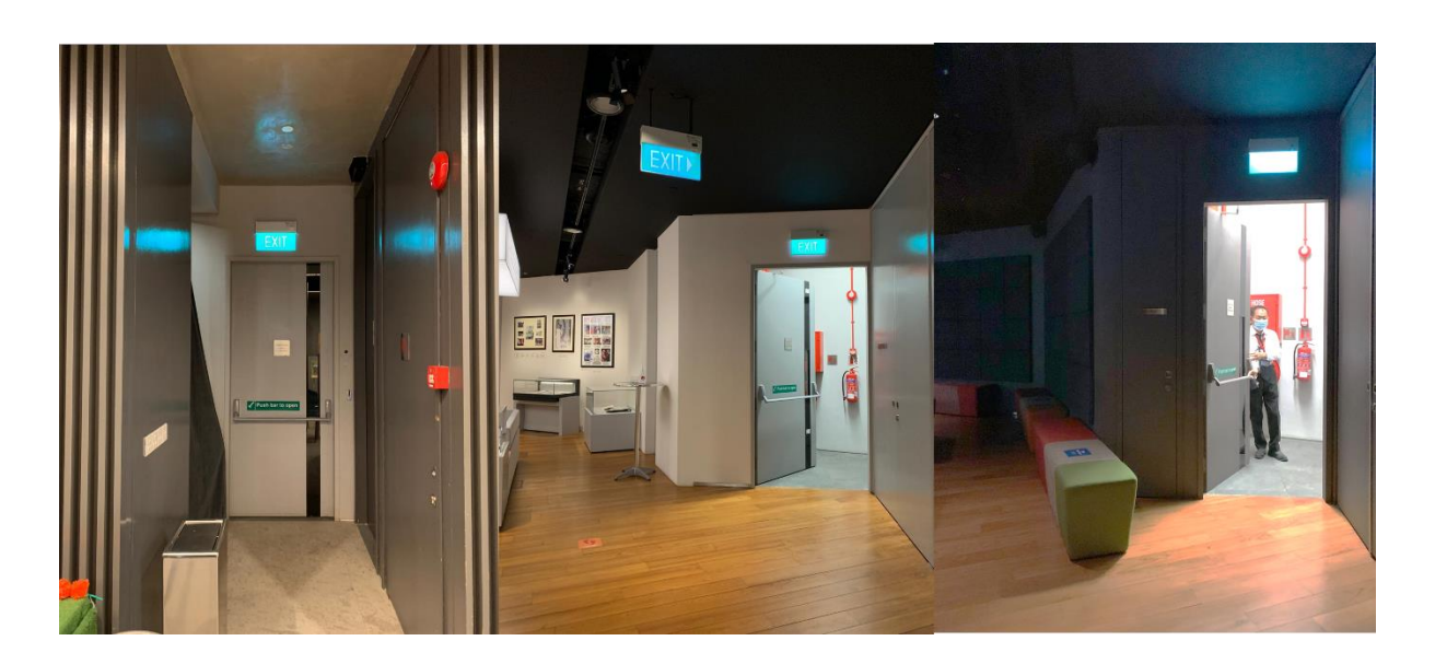
From left to right: emergency access stairs on levels 2 - 4